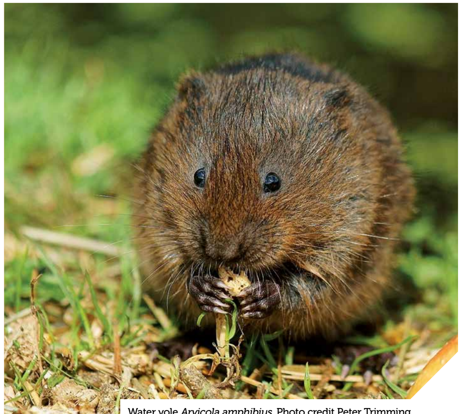
Water vole Arvicola amphibius .

The UK water vole population has fallen dramatically in recent years. Accurate and reliable methods of detecting the presence or absence of water vole at specific locations are critical to conservation efforts. Traditional survey methods can, in some cases, be invasive, inaccurate or difficult to carry out. This study aimed to develop a novel method based on identification of environmental DNA (eDNA) to detect the presence of water vole via analysis of water samples. The results demonstrate that the technique offers an accurate method of detection. However, this study was based on a relatively small sample and certain limitations of the technique have been identified, which will be explored with further research. Nevertheless, used and interpreted correctly, the technique can provide reliable evidence of presence or absence.