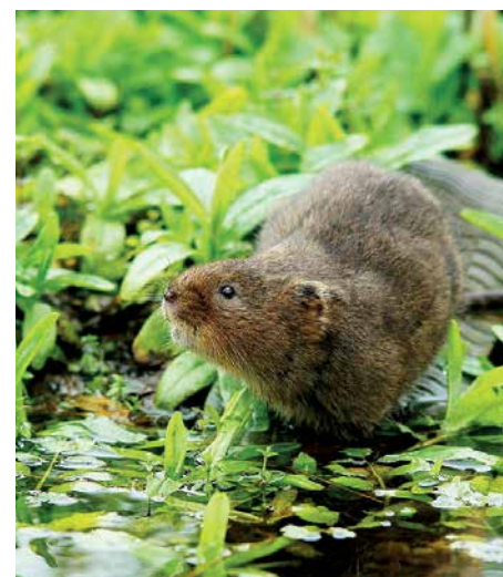
Figure 2. Water vole Arvicola amphibius .

This study aimed to develop a species-specific qPCR assay for the detection of water vole and to field-test this method, alongside traditional sampling methods, to assess its suitability as a presence-absence survey technique that can ultimately be used to better inform the conservation efforts to preserve the species.