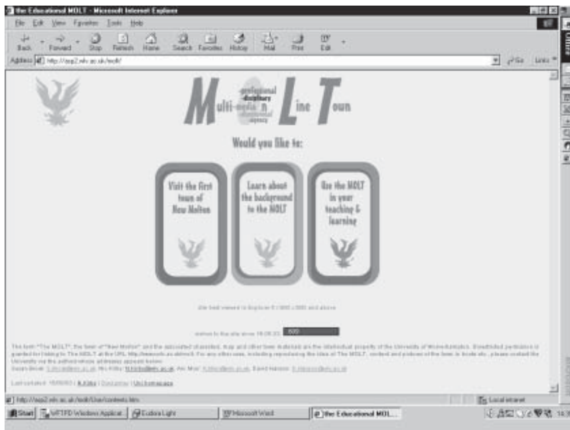
Figure 1. Home page of MOLT

The objectives of our project were to: establish a joint RN/DipHE - DipSW Working Group; explore the relevant literature; identify, and work within, the current limitations of the IT infrastructure; develop the on-line materials; disseminate ideas for use of MOLT; identify and operationalise one use (of MOLT); identify and plan for at least two other uses; evaluate staff and students perceptions of MOLT. We have met these objectives.