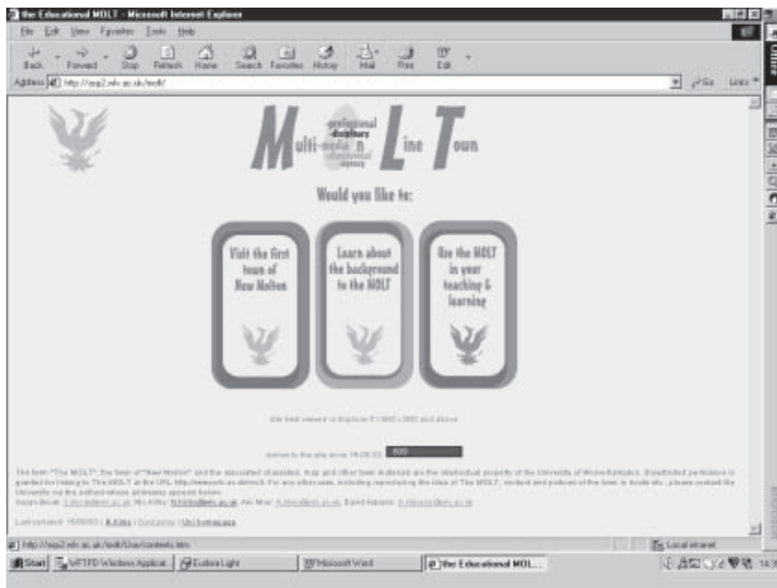
Figure 1. Home page of MOLT

The objectives of our project were to: establish a joint RN/DipHE - DipSW Working Group; explore the relevant literature; identify, and work within, the current limitations of the IT infrastructure; develop the on-line materials; disseminate ideas for use of MOLT; identify and operationalise one use (of MOLT); identify and plan for at least two other uses; evaluate staff and students perceptions of MOLT. We have met these objectives.