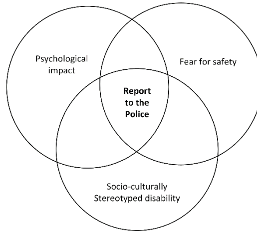
Fig. 3. The interplay of identified factor in reporting cyber-victimisation by disabled people to the police.

The psychological impact is a consistent finding in the literature that is associated with cyber-victimisation experiences [18]. Hence, triggering stress seems to be an important factor contributing to the decision of contacting the police. The second factor is receiving threats or extremely abusive comments, which is documented with online and offline victimisation [36, 37].