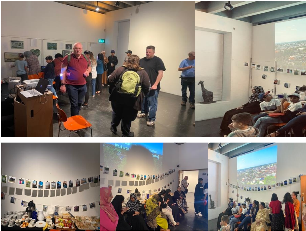
Figure 5 Pictures from the exhibition