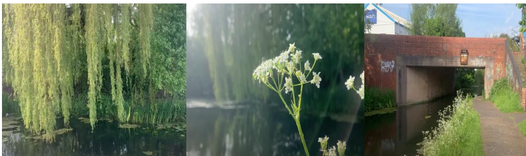
Figure 4 Footage of green spaces in Sound of Walsall

Other elements of the exhibition consisted of examples from local creativity such as painting, sculpture, and creative writing, photography, and poetry, all of which were co-created during the workshops. The entire creative output is accessible on the project's dedicated website, createwalsall.wordpress.com .