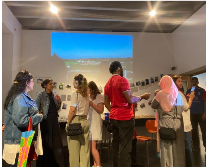
Figure 3 Create Walsall public exhibition, New Arts Gallery, Walsall

Geophonic, biophonic and anthropophonic 3 sounds (Pijanowski et al., 2011; Krause, 2016) presented in the film were recorded during the project in the localities of the communities, emphasising the place-based focus of the output. The footage including green and public spaces, was recorded in the local neighbourhoods (Walsall Arboretum, Walsall Market). To emphasise the importance of local green spaces for the communities we created a separate place-based footage of canals, fields, and local parks, which during the exhibition was projected simultaneously with the Sound of Walsall film.