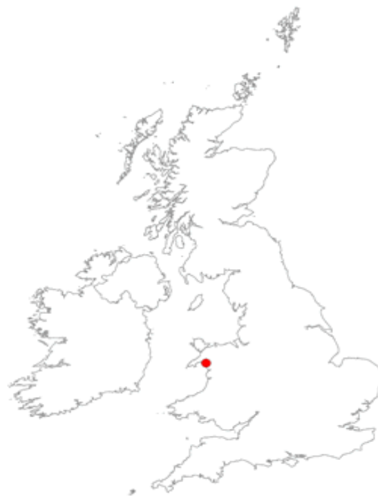
Fig. 1. Location of Morfa Dyffryn within the British Isles

view from the previous year's photo point was obscured by vegetation/dune height growth. If an alternative clearer dune-view could not be obtained within ~3 m, the photo was not used.