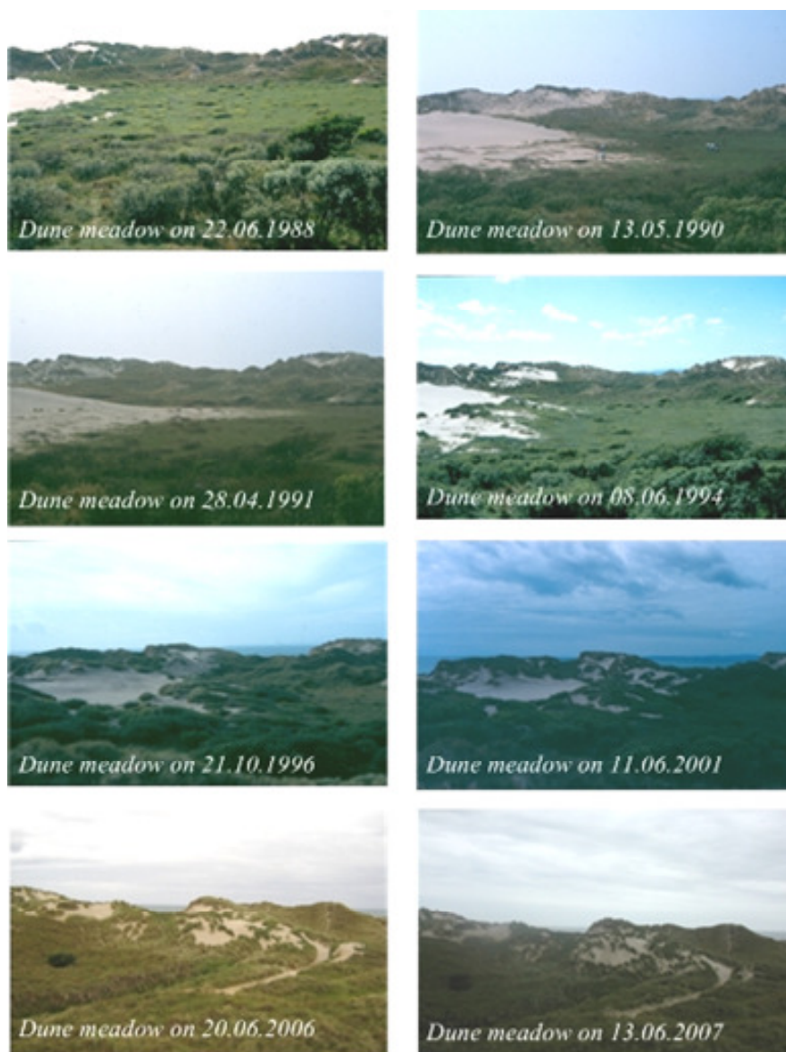
Fig. 4. View west from Station 3. Deflated sand from the foredune was deposited on the dune slack, burying dune meadow vegetation. Vegetation then recolonized the 'sand apron'. Pedological analyses of soil profiles beneath a willow ( Salix cinerea ) copse suggest cyclical patterns of dune deflation and stabilization. Note that otherwise the hind dunes remained morphologically stable