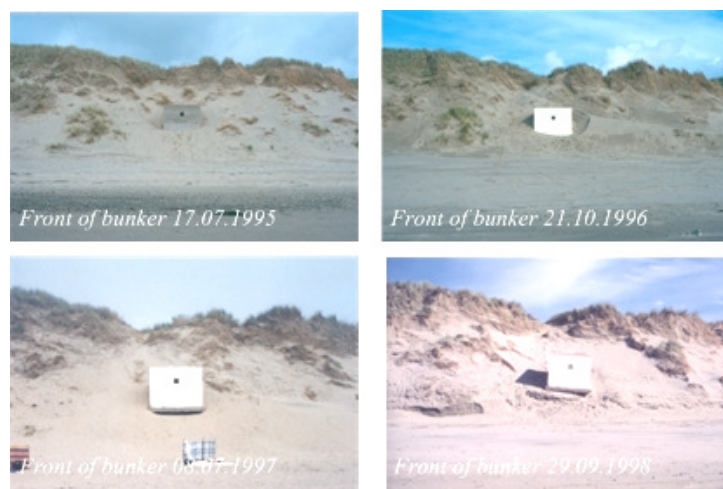
Fig. 3a. View directly in front of the war bunker. In 1995, a Second World War bunker became visible in the foredunes and provided a new fixed point. Observe the deflation of sand