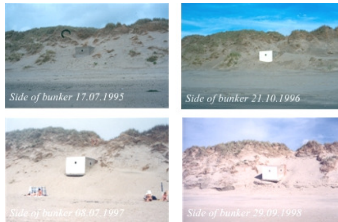
Fig. 3b. View from the south side of the bunker. Observe the exposure of the south-facing window and undercutting of the concrete platform