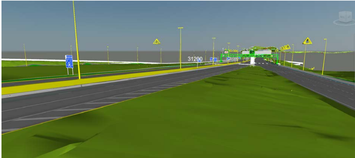
Figure 1 3D model of project; Junction 8