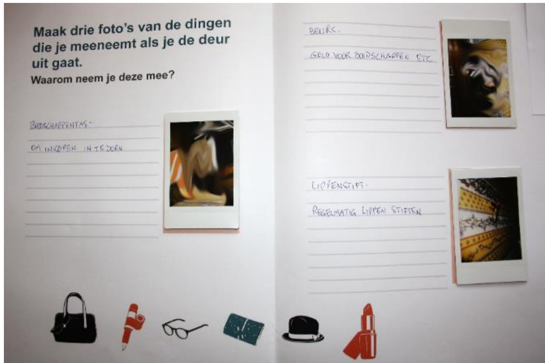
Figure 4 Assignment 7 with Photo task, filled in by Dutch participant. Pictures blurred to protect privacy.

Assignment 7 included a photographing activity with an instant camera. The assignment was to take 3 photographs of the things participants tend to take with them when they go out of the house. This was accompanied by the request to explain in writing why they like to take them and an illustration.