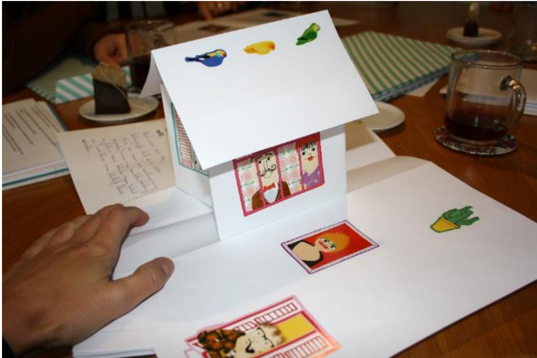
Figure 2 Assignment 3 about what “home” means, photographed during the interview with the participant. Dutch version, this one includes a handwritten description by the participant and use of many of the stickers.

Assignment six comprised pictures of preservation jars and labels that could be written and pasted onto the jars. This assignment was also based on an assignment of Wallace and McCarthy and their question “If you could capture anything (for instance any moment, sound, song, smell, view, object, place...) and preserve it in this jar for you to relive what would you choose?” (Wallace et al., 2013b). It is a handicraft assignment, similar to the pop-up house, albeit only two-dimensional.