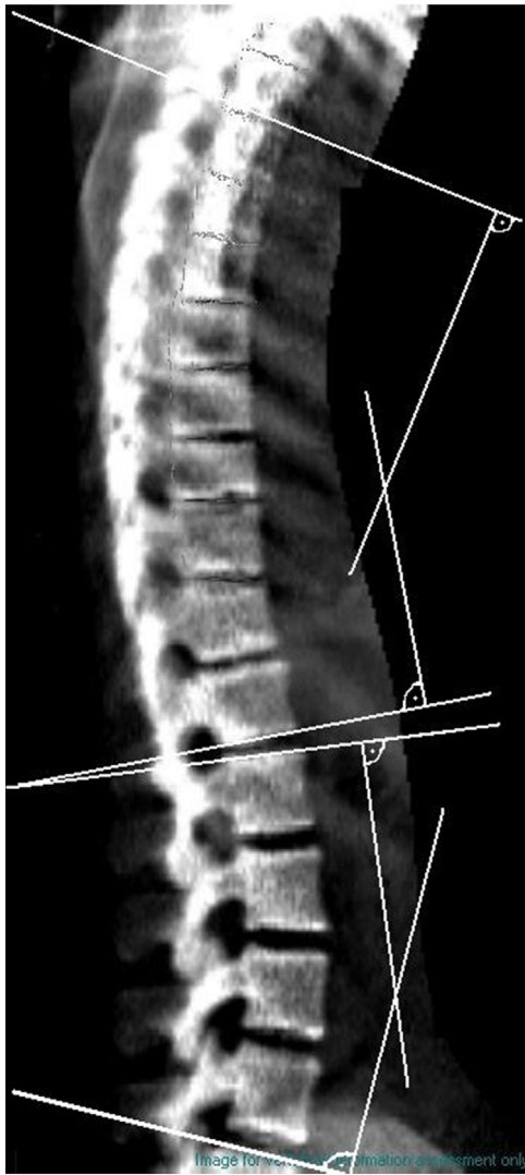
Fig. 2 – Lateral view of the spine on track and field athlete participant.

( 5.7 \pm 4.7^\circ for men; 8.7 \pm 5.9^\circ for women) angle values. There was also no correlation between the age of starting regular trainings and both thoracic kyphosis and lumbar lordosis angle values.