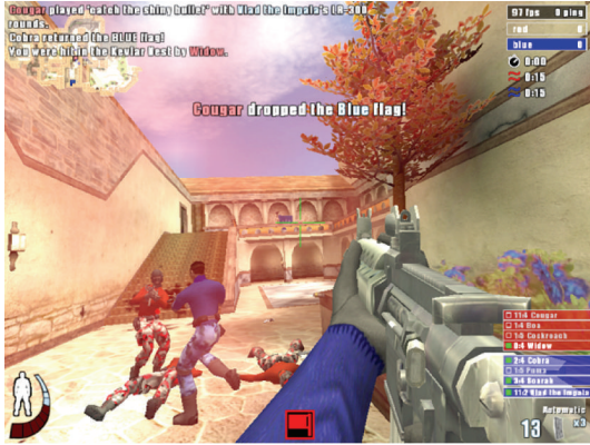
FIGURE 2: A screenshot from Urban Terror .

This paper extends a paper [4] presented by the authors at the Cybergames 2007 conference by exploring the implications of the conceptual framework described there for the future development of the audio component of game engines.