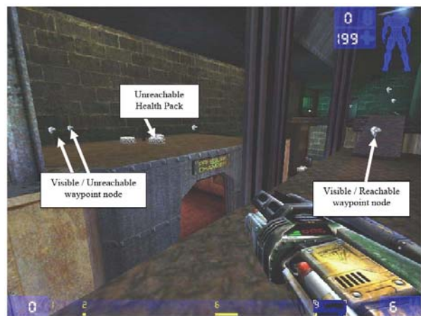
Figure 3: Navigation messaging system

unreachable. In the illustration, there is a gap between the game agent, and a platform containing the health packs; it can therefore see them, but cannot reach them directly. The navigation node to the right of the illustration is visible and reachable directly. Therefore, the agent can run directly to it. This information is grouped into a single message block, and sent to the intelligent BDI agent. The intelligent agent receives this message, parses it, and populates its belief sets. New nodes (nodes an agent has not seen before) are added to the list of known nodes. Nodes at the position of the agent are marked as 'visited' to indicate the agent has explored the position. Two other data sets are populated; visible nodes and reachable nodes. At each frame, these sets are cleared, and populated with the new data contained in the message i.e. only nodes that the agent can currently see are stored.